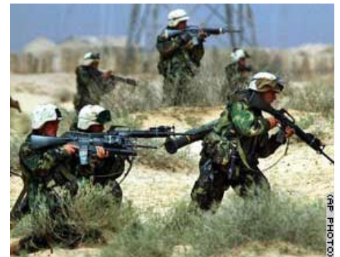
Above: The Sikes Act ensures that military bases maintain habitat for realistic training.

For more information about Sikes Act Coordination, contact U.S. Fish and Wildlife Service's Fisheries and Habitat Conservation at 703/358-2161 or visit us on the Internet at http://www.fws.gov/habitatconservation/ .